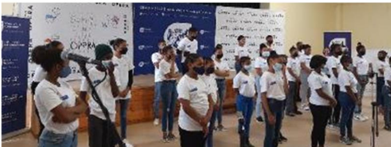
CAPE TOWN OPERA OUTREACH FOR GRABOUW AT DE RUST FUTURA ACADEMY