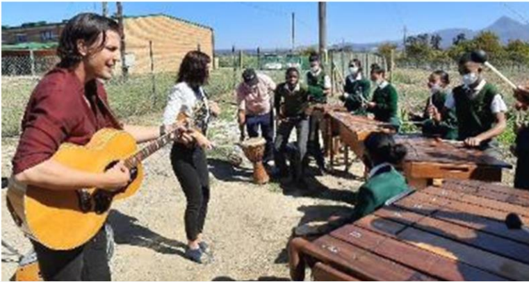
BOTTOMLESS COFFEE BAND DE RUST FUTURA JAM