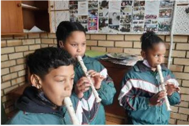
GR 5 RECORDER PUPILS