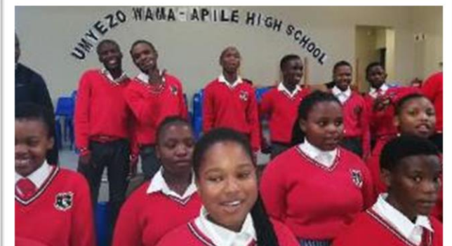
UMYEZO WAMA APILE HIGH CHOIR