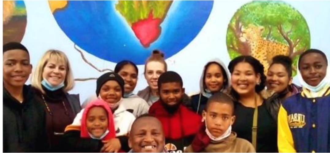
GLEN ELGIN PRIMARY SATURDAY MARIMBA WORKSHOP