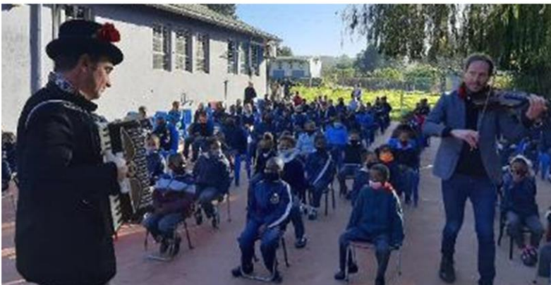
LIVE CONCERT AT MAXONIA PRIMARY