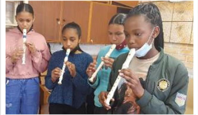
TRINITY EXAM PREPARATION GRABOUW HIGH