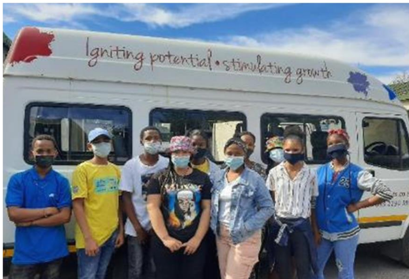
DENNEGEUR FOUNDATION PERFORMANCE BAND