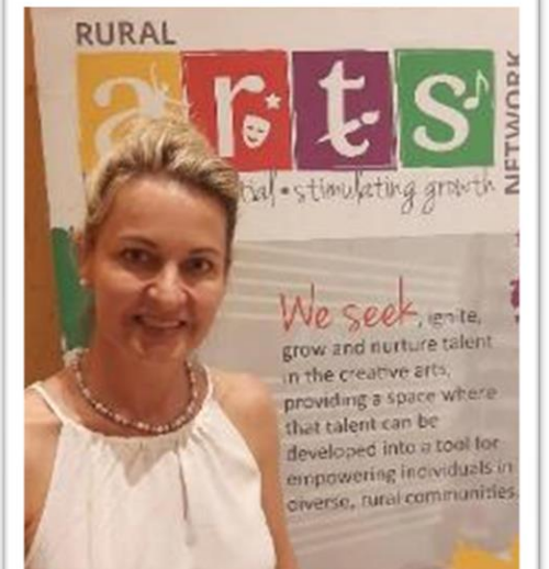
KAREN MARITZ SECONDARY SCHOOL ART