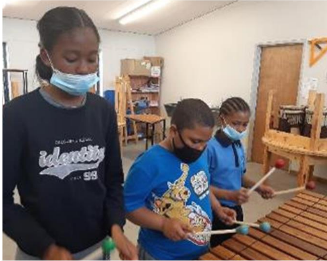
PINEVIEW PRIMARY AFTERNOON WORKSHOP