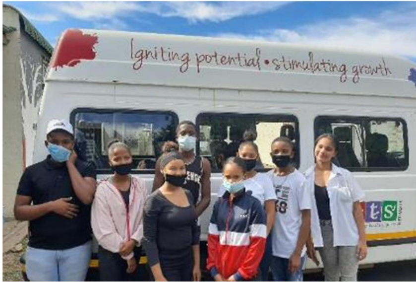
DE RUST FUTURA PERFORMANCE BAND