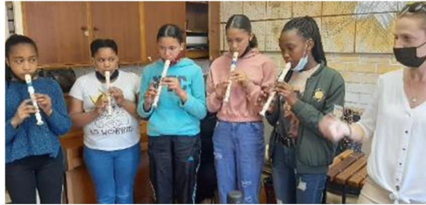
TRINITY COLLEGE EXAM STUDENTS