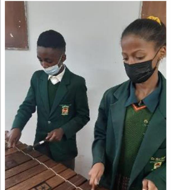
DE RUST FUTURA SECOND MARIMBA BAND