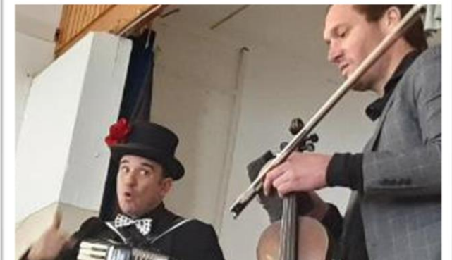
LIVE CONCERT AT GLEN ELGIN PRIMARY AS PART OF MUSIC APPRECIATION EXPOSURE