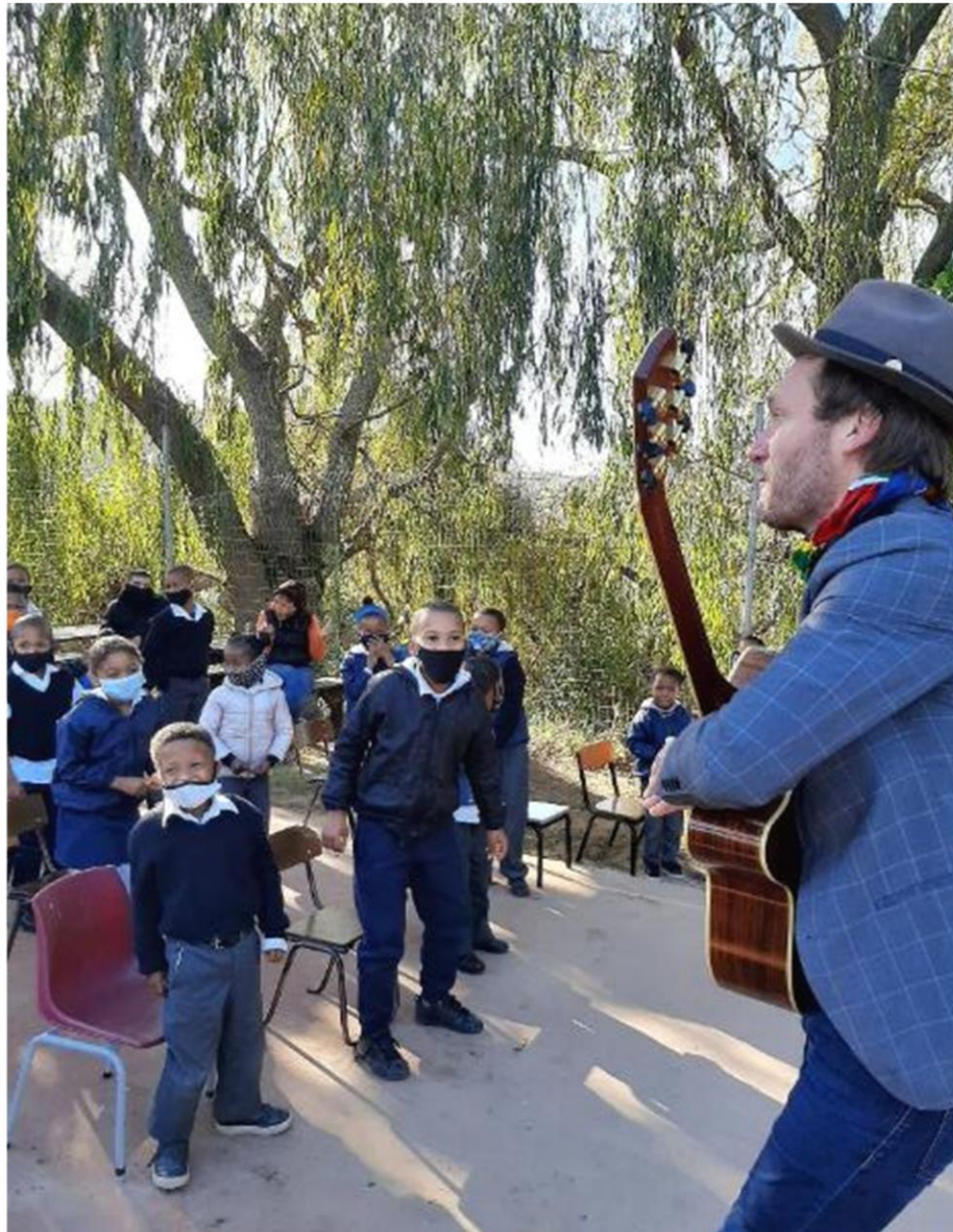
CONCERT AT MAXONIA PRIMARY