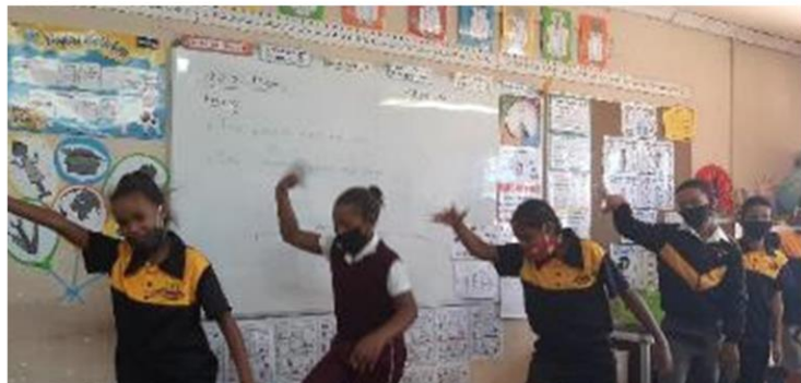
DENNEGEUR PRIMARY MUSIC APPRECIATION ACTIVITIES