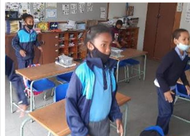
MUSIC APPRECIATION CLASS AT PINEVIEW PRIMARY