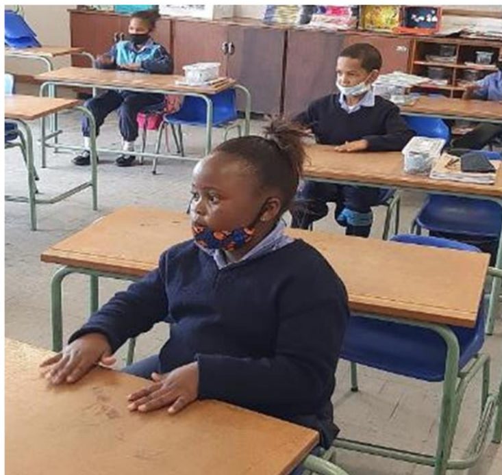
FACINATED LEARNER PLAYING DRUMS ON TABLE